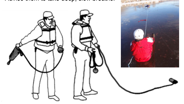
Toss the victim a rescue throw bag. Tell the victim to hold onto the rope kick with their legs as if swimming as you try to pull them out of the water and onto the ice. Your own clothes could serve as a line if all else fails: Yes, it means you'll have to tolerate the bitter cold for a few minutes, for the sake of saving the person in distress. If you wear a sweater, or some other item not as bulky as overcoat, attempt to use it first. Tie a knot at the end of each sleeve, hold on to one and throw the other to the victim.

stay afloat, they have time to be rescued. Advise them to take deep, slow breaths.