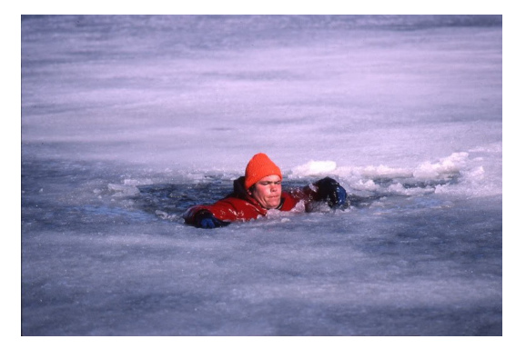
Someone has fallen through the ice. Your first instinct may be to run to the person's rescue, this can lead to both of you falling into the ice and being just as helpless. You should avoid approaching the hole in the ice unless the victim is unconscious or in imminent danger of slipping into the water and drowning, either from weakness or an inability to swim.